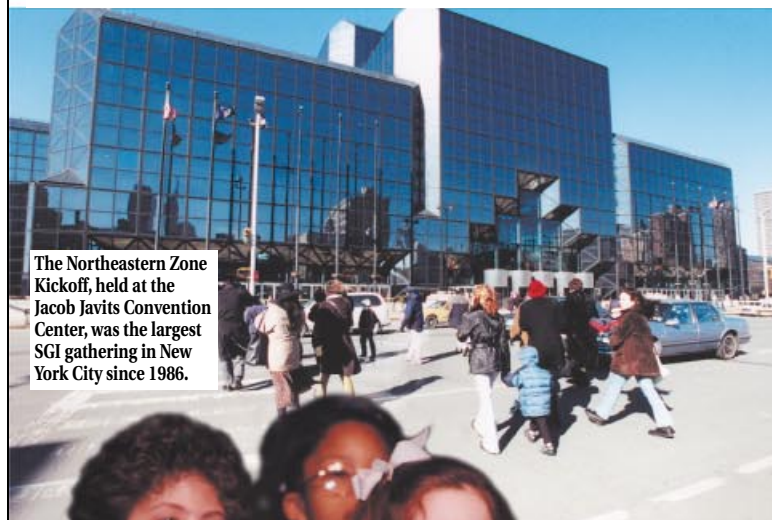
The Northeastern Zone Kickoff, held at the Jacob Javits Convention Center, was the largest SGI gathering in New York City since 1986.