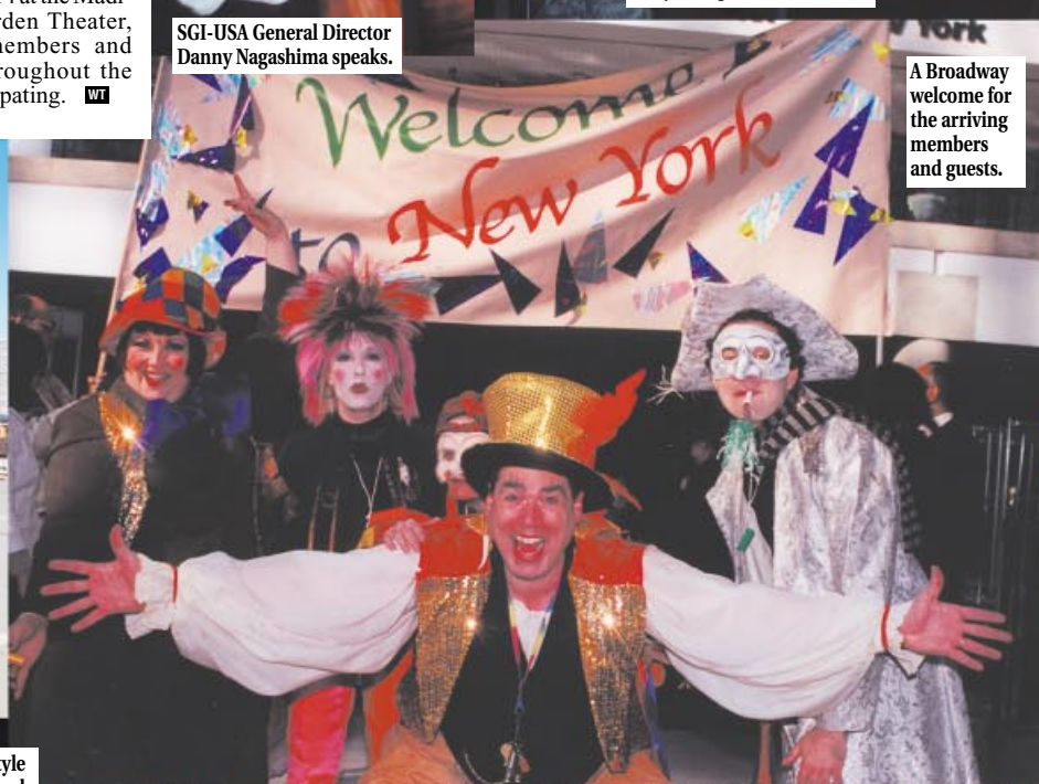
A Broadway welcome for the arriving members and guests.