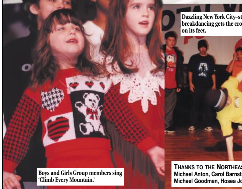
Boys and Girls Group members sing 'Climb Every Mountain.'