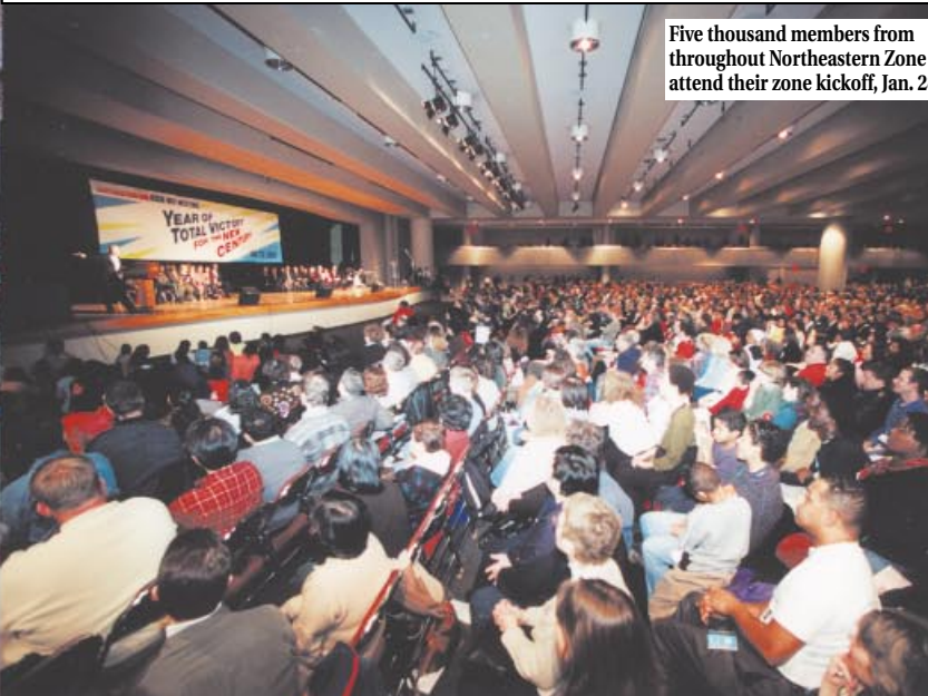
Five thousand members from throughout Northeastern Zone attend their zone kickoff, Jan. 28.