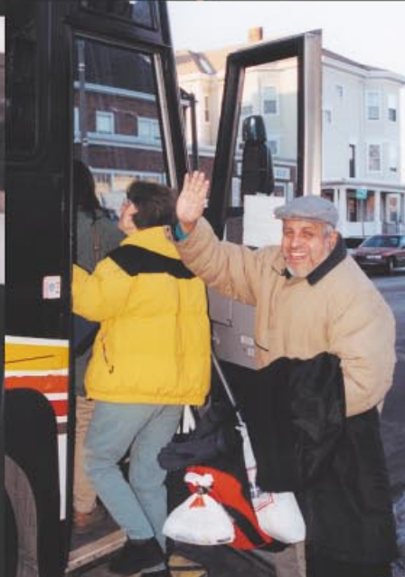
Boston members board a bus for New York City early the morning of Jan. 28.